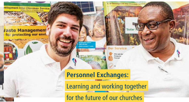
Personnel Exchanges: Learning and working together for the future of our churches