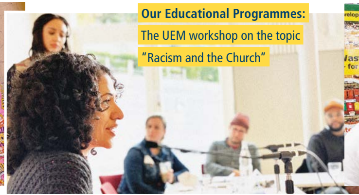
Our Educational Programmes: The UEM workshop on the topic "Racism and the Church"