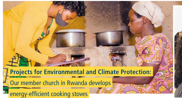
Projects for Environmental and Climate Protection: Our member church in Rwanda develops energy-efficient cooking stoves