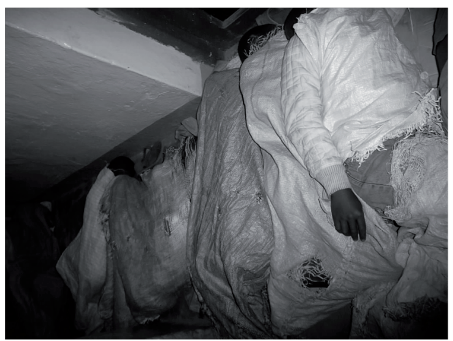
ELCT/NWD is ardently working to address the problem of children working and living on the street

Church leaders need to encourage their members to regard caring for orphans and vulnerable children as defending the quality of their discipleship.