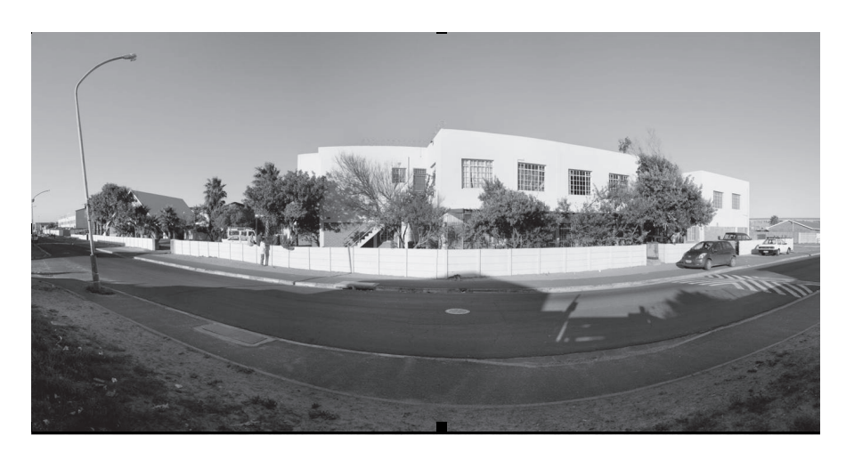
New World Foundation Community Development and Training Centre in Lavender Hill

NWF operates from its own community centre covering an area comprising the communities of Lavender Hill, St Montague Village, Hillview, Seawinds, Vrygrond/Capricorn (formal settlements) and Cuba Heights, Military Heights, Village Heights and Overcome Heights (informal settlements) in the so-called Cape Flats, near Cape Town.