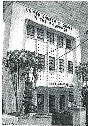
UCCP headquarters in Manila, Philippines

churches in Africa and Asia are affected by injustice, torture and war in the most terrible way imaginable. Regarding the war, the bestial murder of more than 500.000 people and millions of refugees, the Churches in Rwanda are in a situation where they have to rebuild their whole work from the beginning. The events in the Batak Protestant Christian Church (HKBP) in Indonesia also are disturbing. In relation with the ongoing interference of military forces in internal church affairs, pastors and other church co-workers and church members were arbitrarily arrested and tortured. A peaceful solution of the conflict which could save the unity of the Church is not in sight. In other partner churches also the situation is characterised by suppres-