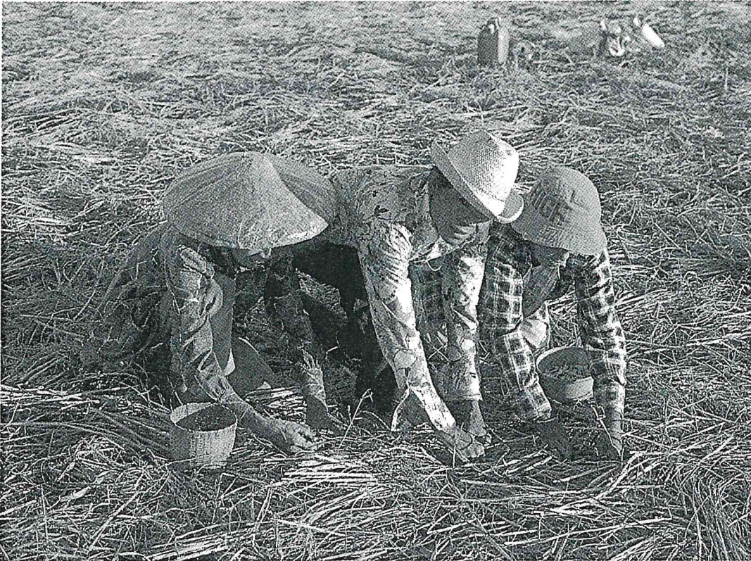
Harvesting in Northern Luzon Province, Philippines