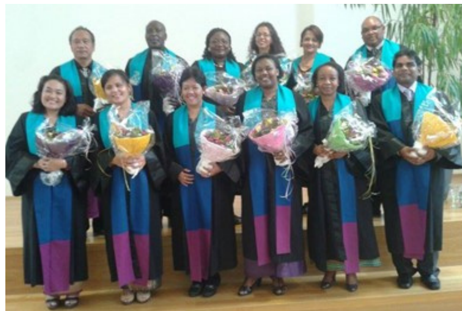
IMADM K2 (2013-2015)

vision which led to the establishment of cooperation between the Institute for Diaconic Science and Diaconic Management-IDM, Wuppertal/Bethel. The first cohort – K1 of twelve (12) students were admitted in 2011 and successfully completed in 2013. In September 2020, the fourth cohort – K4 graduated and for the first time with final exams conducted digitally due to the Covid-19 Pandemic. The IMADM can boast of producing top executives for churches, theological institutions, universities, diaconic institutions and PhD candidates