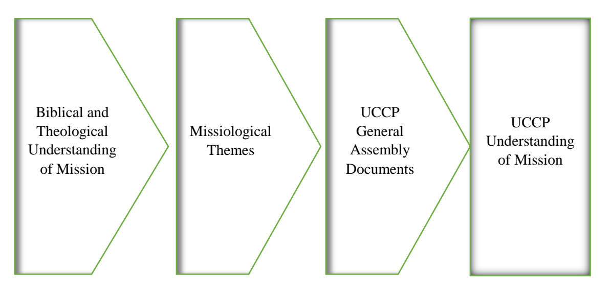
Figure 1. Research flow of the Study

With this biblical and theological framework, we now have a guide on how we can proceed in answering the questions found in this study. As shown in the diagram, the biblical and theological understanding of holistic mission is profoundly discussed as a starting point for this study. After establishing the biblical and theological understanding of mission, we proceed to the specific theological themes of holistic mission which are mission as proclamation, mission as development, mission and human rights. With these theological themes we are then to look at the UCCP General Assembly Statements which deals with mission and interpret them based from these themes. Finally, after interpretation we can glean out what is the UCCP understanding of mission based from these documents.